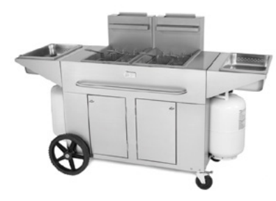
PF-2 Double Tank